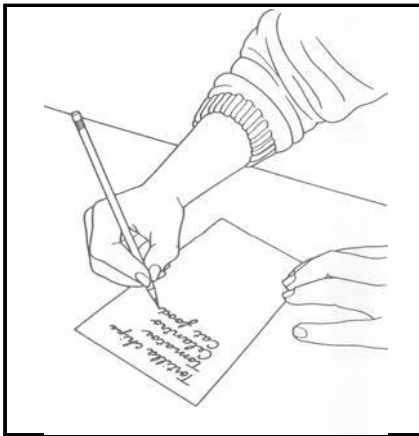
Make a shopping list with a pencil.

You indicated that you have some restrictions with tasks such as those shown below. Let us know if we do not seem to be adequately addressing problems such as these, or if you have recently experienced difficulty in these areas. Most importantly, let us know if you are experiencing difficulty with other tasks that you regularly perform at work or home. We want to do everything we can to help you improve your physical abilities.